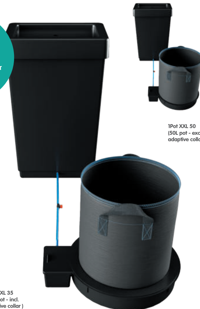
1Pot XXL 50 (50L pot - excl. adaptive collar)